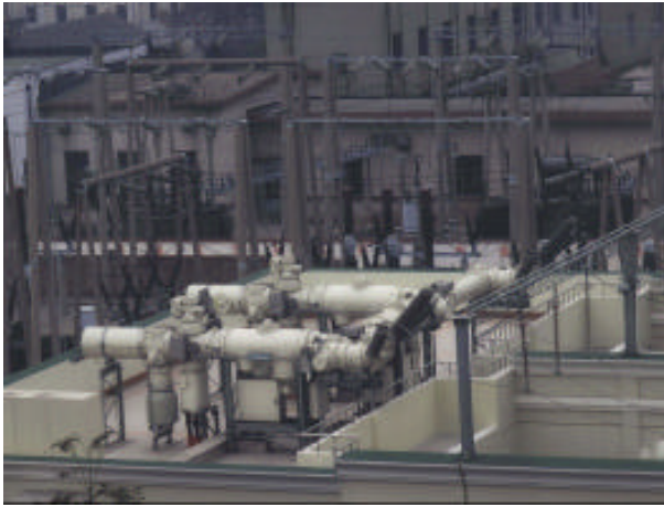
Fig. 5: Example of a 145kV HIS-substation in H-arrangement with 3 circuit breakers placed on the rooftop of the transformer building in China

Figure 5 shows an existing 145kV AIS substation in China being extended by two additional overhead line connections by implementing an HIS solution. The substation is located in a densely populated area with stringent space constraints. The flexible and compact design of HIS made it possible to place the substation on top of the control building. The H-arrangement with 3 circuit breakers covers a surface area of 240 sq m