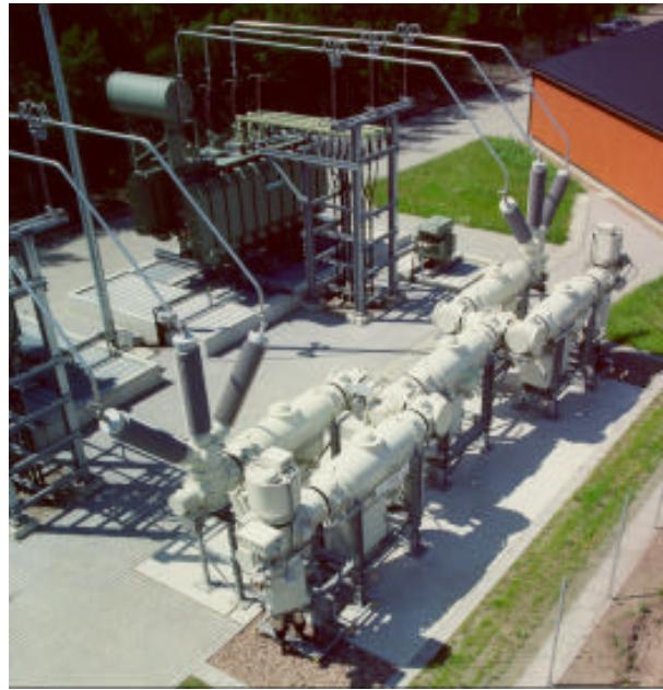
Fig. 4: Example of a 145kV HIS-substation in H-arrangement with 5 circuit breakers in Germany

The 145kV HIS is characterised by a completely three-phase encapsulated, one-level design which is ideal for implementation of a simple substation layouts like H/ T/ In-Out schemes. Every active component is segregated from the next component, which increases the reliability and operator-friendliness.