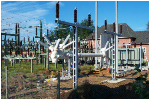
Fig. 1: Installation of a 145kV HIS substation as a space saving and reliable solution for the extension of an existing AIS substation

The Highly Integrated Switchgear (HIS) is a state-of-the-art compact GIS solution for indoor as well as outdoor applications. Besides providing optimal solutions for new GIS substation installations including certain standard configurations like H/ T/ In-Out schemes; its strength lies in offering highly flexible solutions for extensions and/or retrofit programs of outdoor as well as indoor type conventional (AIS) substations.