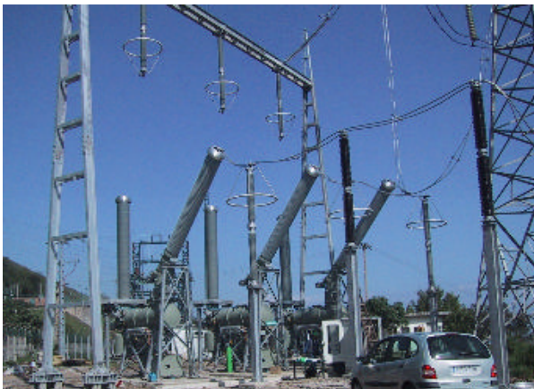
Fig. 6: Installed Single In/Out-bay of a 420kV HIS-substation in Spain

The 420/ 550 kV HIS switchgear is based on a single-pole design with single-pole drives for the circuit breaker and disconnectors. The complete switchgear including the operating systems of the disconnectors is encapsulated. The single phase encapsulation is necessary due to the requirement for high insulation clearing distance for this voltage level.