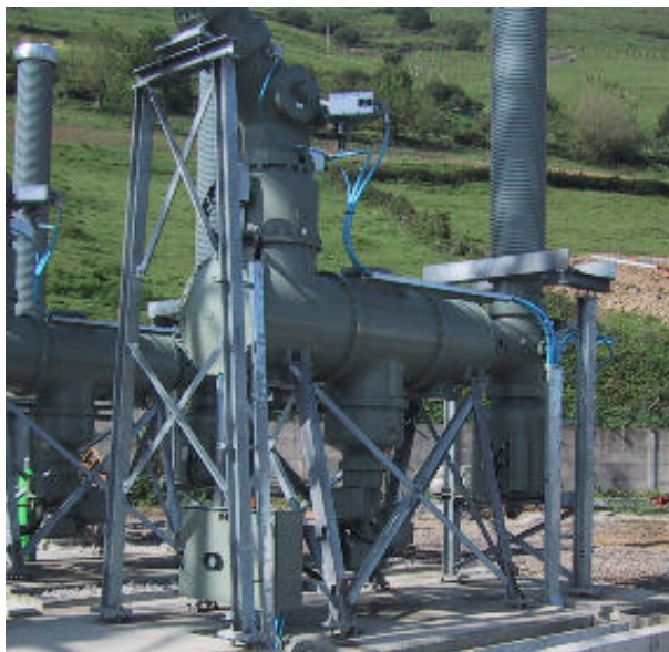
Fig 3: Complete 420/ 550 kV circuit breaker pole with C.T., V.T., disconnectors, earthing switches in separate gas compartments

Consequently, the operating utility does not have to maintain service personnel capable of detecting failures and carrying out repair work. The strict separation of the gas compartments by gas-tight bushings makes it easy to exchange any active module independent of the other components of the switchgear.